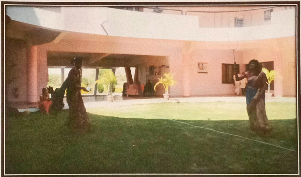
Winners List: Badminton

Badminton Competition was held on 21 st Feb.2017 in our institute as Physical Education is an integral part of the total education system. It helps in the attainment of the ultimate aim of education i.e. the achievement of holistic development. Games and Sports play a vital role in the student's life. A student should study hard to be successful in competitive examinations. But, he should also play games and sports to enjoy the health and vigour of life. Along with bookish learning, a student should spend his time on games and sports also. Either study or work alone makes us exhaust. We remain no longer efficient to do any work.